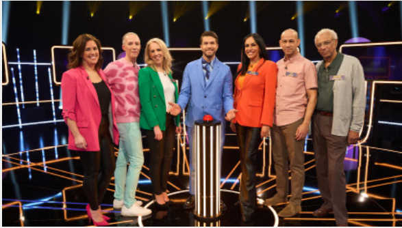
In With A Shout Saturday, 6pm 8th April ITV1

Joel Dommett hosts the high-octane show where two families battle against each other in a thrilling game - with a uniquely challenging twist - in a bid to win big.