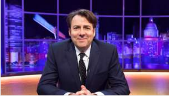
The Jonathan Ross Show Saturday, 9.25pm 7th March ITV1

Jonathan Ross hosts a mix of chat, infectious wit and fun as he welcomes terrific celebrity guests and asks questions that everyone wants to know the answers to.