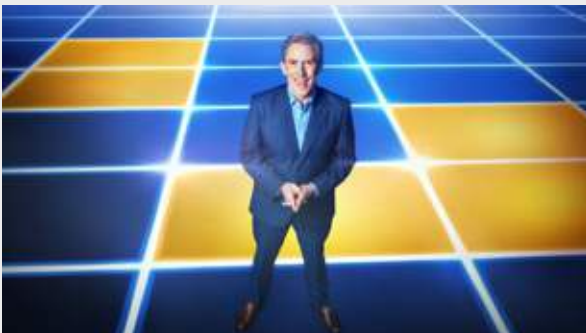
The Floor Sunday, 7pm 8th March ITV1